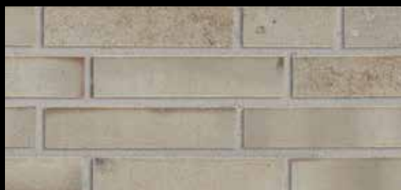
671 kornbeige Δ < 3 % · DIN EN 14411, Gr. A 1