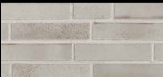
670 sandweiß Δ < 3 % · DIN EN 14411, Gr. A 1